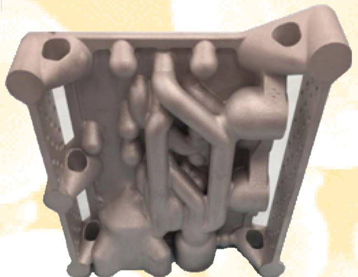
NATEP Project — HighSAP, demonstration part.